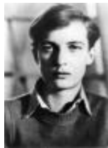
Annemarie Schwarzenbach, 1932