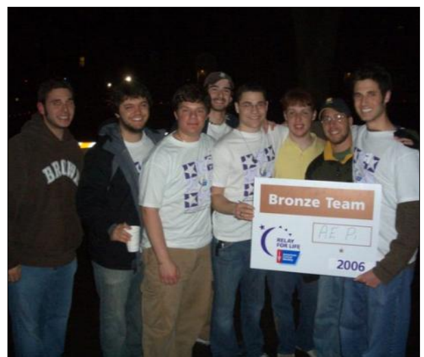
AEPi was awarded a bronze award for raising the third most money of any group at Brown for the American Cancer Society.