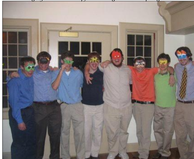
Pledges in Hillel at our Seder, each wearing a mask of one of the plagues

Our serenades were probably my favorite part of pledging. Singing both Beastie Boys' "Girls" and Dropkick Murphy's "Kiss Me, I'm Sh*t-faced" across campus was one of my most memorable and fun times at Brown this year. We sang to both sororities, a lot of our friends at AEPi, random people at Jo's, and those who we thought were studying a little too hard at the CIT, SciLi, and Barus and Holley. On the whole, it was a fun-filled night and we all went home with no voices left.