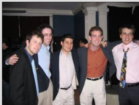
Brothers at a recent semi-formal cocktail

In addition to their customary education, the pledges became close friends through a number of projects. To ensure that the pledges knew all of the Brothers early in the pledge process, the first major project was to complete pledge books, where each pledge researched facts about every Brother. However, new this year, the pledges then collectively created one Brother Book, in which each Brother has a unique page with his picture, biographical information, and a brief narrative paragraph. Also, the pledges held a fantastic party that entertained Brothers and guests all night,