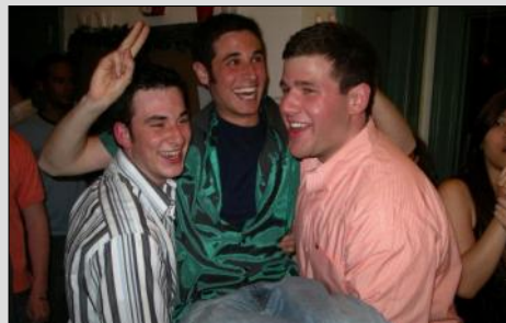
Brothers share a memorable time during a cocktail party