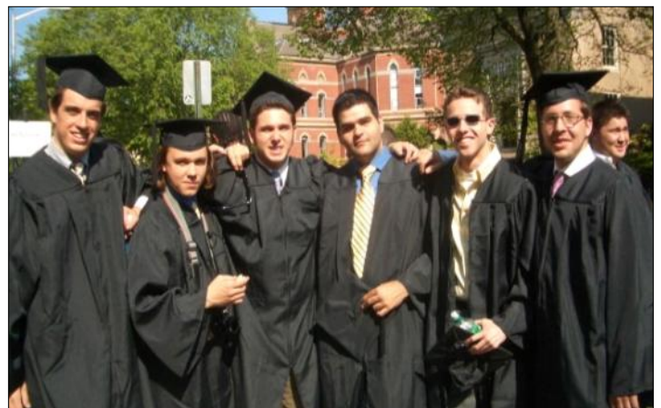
Graduating seniors during the commencement celebrations