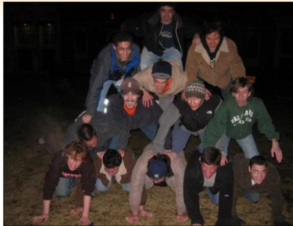
Pledges form a human pyramid to get back the pledge brick

Our final project was the painting of the bar room. Although we went through several coats of paint to change color combinations, it is now done and to all of our likings.