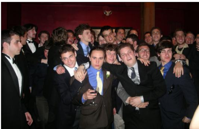
Brothers at the spring formal at Café Nuovo