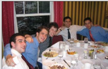
Brothers celebrate initiation