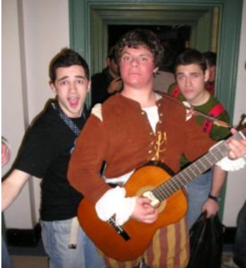
Pledge Serenades at AEPi