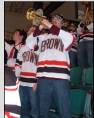
Brothers in the Brown marching band playing at a recent hockey game