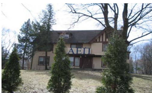
AEPi house at the University of Michigan