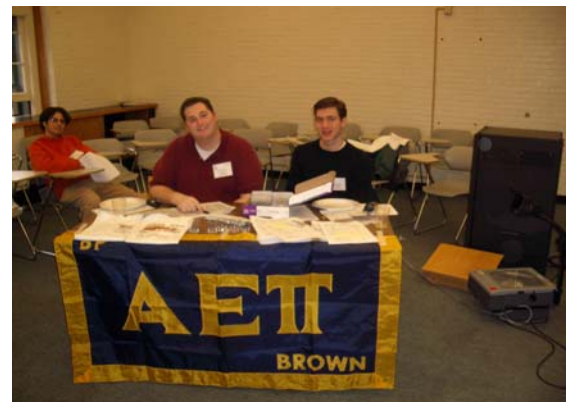
Brothers welcoming attendees to Conclave