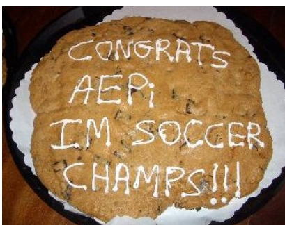
Championship Meeting Street cookie