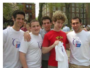
Brothers at the Relay for Life