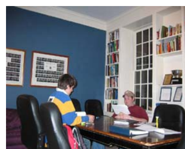
Our newly renovated Library