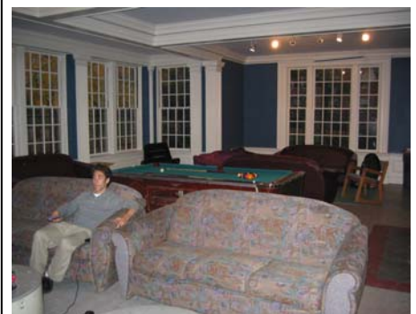
Our repainted and revamped lounge