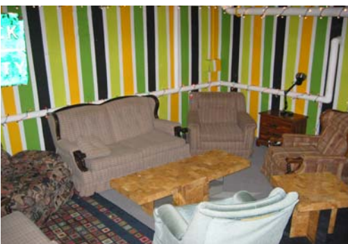
Our new "Striped Room" basement lounge