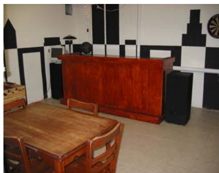
The newly tiled barroom