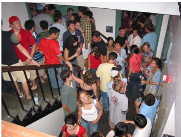
Partygoers fill Marcy House for Body Chemistry VII